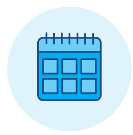
We held 44 events reaching 3490 industry professionals

67% of attendees were from member organisations which means 1152 new faces